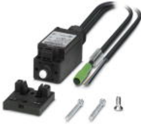
Door position switch with 3 m cable with open cable end and 0.6 m cable with M8 socket (Snap-in), including mounting accessories

Please be informed that the data shown in this PDF Document is generated from our Online Catalog. Please find the complete data in the user's documentation. Our General Terms of Use for Downloads are valid ( http://phoenixcontact.com/download )