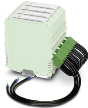
Figure shows variant for 4 modules

http://eshop.phoenixcontact.de/phoenix/treeViewClick.do?UID=2900754