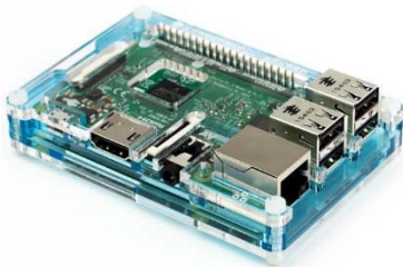
Coupé Flotilla PIM164