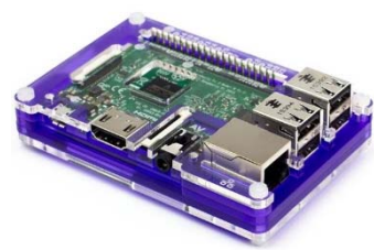
Coupé Royale PIM163