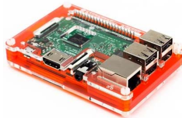
Coupé Tangerine PIM165