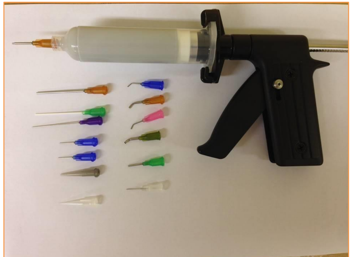
Dispenser Gun with all the TIPS

Flexible TIPS: Flexible polypropylene 38.1 mm or 12.7 mm (1.5" or 0.5") tubing for application onto sensitive areas. Easily drags along edges and around corners; flexible for access to hidden areas.